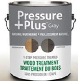
PRESSURE PLUS GREY