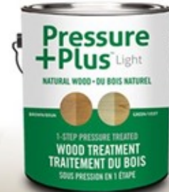
PRESSURE PLUS LIGHT